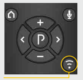
If your sound processor is paired with more than one wireless accessory press once, twice, or three times to toggle between the accessories. If you cannot connect to your wireless accessory, move closer to it and try again.